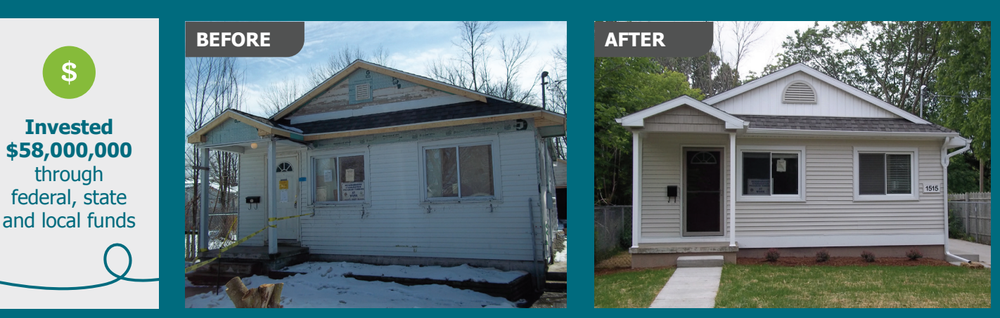
Renovated 255 single-family homes

In 2005, the Ingham County Land Bank was the second county land bank established in Michigan—now more than half of Michigan counties have a land bank. 15 years later, we are proud of the accomplishments we've made.