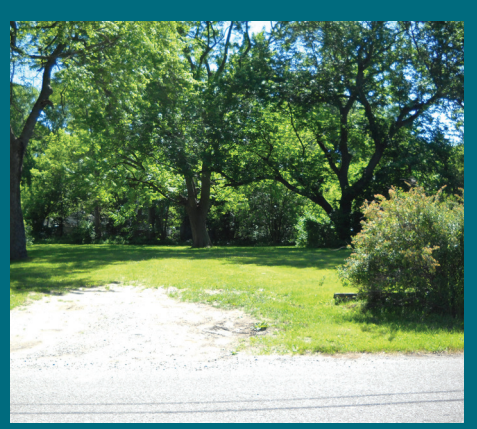
Sold over 500 vacant lots