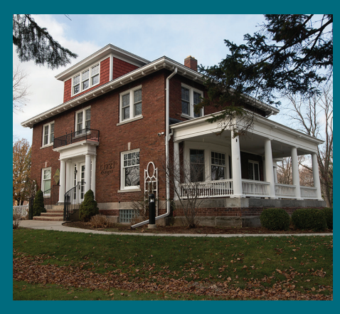
Created a pipeline of over 200 properties sold to nonprofits and investors for development and/or renovations

"The Ingham County Land Bank has had a tremendous impact on the revitalization of our neighborhood over the last 15 years. The Land Bank has chosen several strategically-located, tax-foreclosed houses to renovate and this has improved the overall appearance of many areas. This has helped to boost property values and helped this area to be a more functional place to be proud of. Houses that would not sell 15 years ago are now being sold and the neighborhood continues to improve."