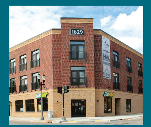
Sold over 20 commercial properties for redevelopment